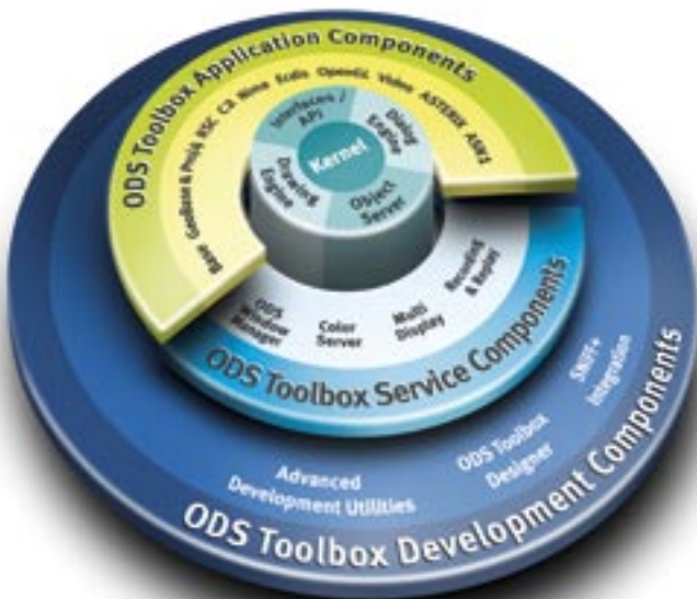
The ODS TOOLBOX provides a wide range of combinable modules

Ref. T-C-WJHTC-0206 © 2006 Barco Technical specifications are subject to change without prior notice