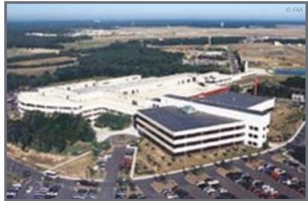
William J. Hughes Technical Center, Atlantic City, NJ

The ODS TOOLBOX runs on a wide range of standard equipment from different vendors including most UNIX and MS Windows® NT platforms. Software developed on top of the ODS TOOLBOX is portable across these platforms. This ensures a low initial investment plus a good investment protection.