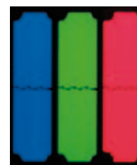
IPS-Pro Relative brightness: 125%