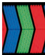
IPS Relative brightness: 100%