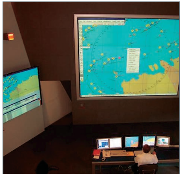
Example of a private remote communication center connected with the VTS/VTMIS Infrastructure and equipped with Barco's large display walls.

Barco's product range bundles cutting edge hardware with software expertise and integration experience. As the competence center for sensor data processing and visualization software within the company, Barco Orthogon provides a suite of tailored solutions for the areas of Air Traffic Control, Vessel Traffic Services, Coastal Surveillance, and Defense & Security systems.